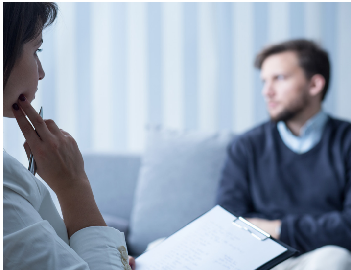
EyeDetect will revolutionize your counseling with the unfaithful.

Complete Analytics & Reporting – Test results may be filtered by date, department, test type, credibility score, and more.